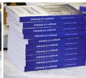
Just published – a bestseller!