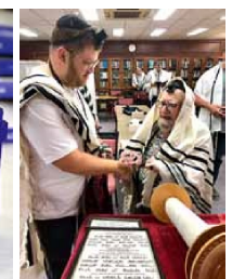
Celebrating 101 in Shul on Thursday 5 December